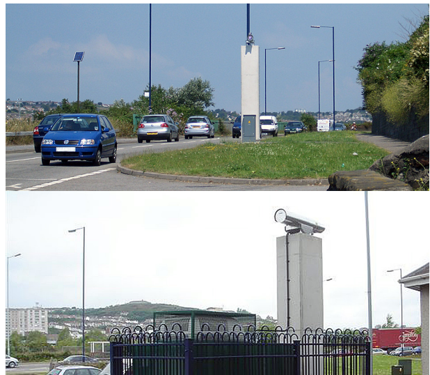
The OPSIS monitoring system is an important tool for continuous environmental control of a range of gaseous compounds at street level

For further information, please visit www.opsis.se .