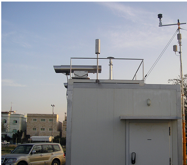
An OPSIS system installed at street level monitoring the urban air quality

The OPSIS system has low cost of ownership based on few moving parts, long intervals between calibrations, easy operation and low energy consumption.