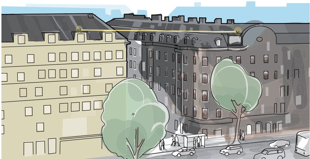
An OPSIS system monitoring the urban air quality

For further information, please visit www.opsis.se .